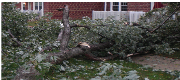
Storms continue to take down trees. This tree recently fell into the courtyard of the Commons of Arlington.

Currently, political signs are allowed to be placed up to one month before an election, but are supposed to be removed within five days after the event.